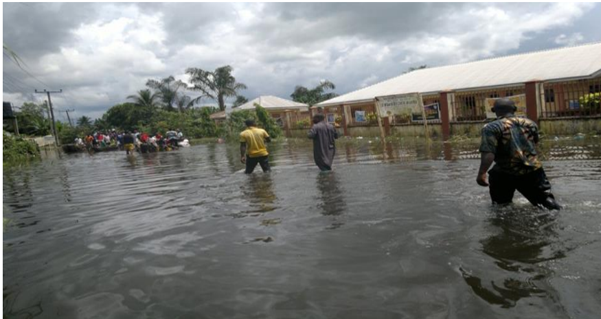
Figure 1 Pictures of Flooded Study Area

With the history of devastating rise and fall of the level of water of Orashi River mostly in 2012 and 2018 which has affected millions of human population and caused fiscal losses of property worth of billions of naira by multi nationals companies and individuals in the study area, Hence, it becomes imperative to identify the factors causing these seasonal changes in volume of water of Orashi River and changes in its geometry as it impact on the inhabitants and its environment. It is also important to explore more realistic approach in studying the dynamics of Orashi River in other to develop a more appropriate model for future monitoring of the dynamics of Orashi River.