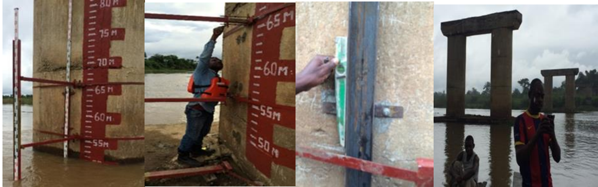
Figure 3 Water Gauge Fabrication

After the installation of the gauge, Heights and coordinates were transferred to the gauge and the base of the pier, referencing IDU1 and 2.