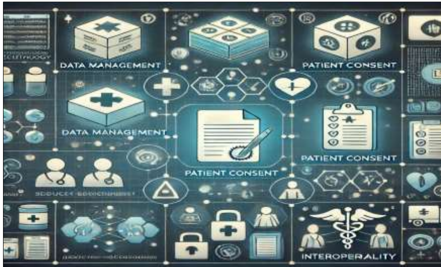
Figure 2 Various use cases of blockchain technology in healthcare, emphasizing data management, patient consent, and interoperability