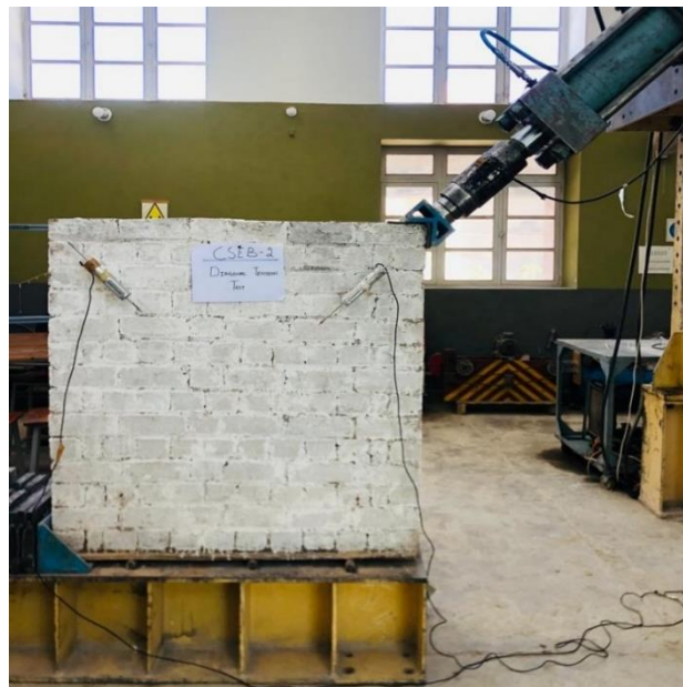
Figure 1 Final Samples for Testing

The mechanical shear parameters, including indirect tensile strength, shear strength, shear strain, and modulus of rigidity, are determined through the diagonal compression test conducted on compressed earthen bricks. In this test, the walls are subjected to a constant and uniform compressive load, while cyclic diagonal loading is applied to evaluate the performance of the masonry. To confine the specimens diagonally, loading shoes are attached at each end (Figure 1).